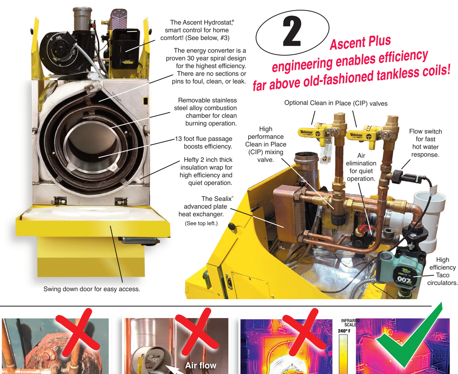
Tankless coil boilers often fail at their coil flanges or cast iron fittings. Ascent Plus

has no coil flanges or cast iron fittings.